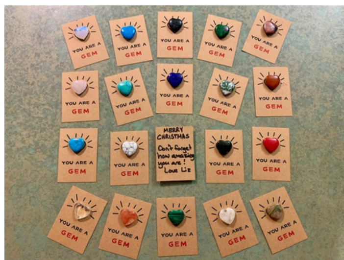
Christmas gifts for Silverdale learners